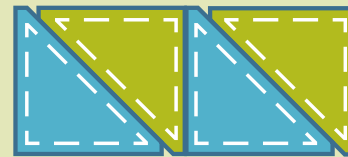
Half Square-4" Finished Triangle 55031