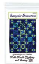
Sampler Sensation (50544)

Other patterns using Square-6 1 / 2 " (55000) available at accuquilt.com :