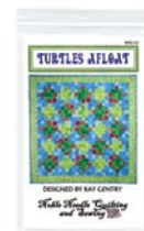
Turtles Afloat (50556)

Other patterns using Square-2" (55022) available at accuquilt.com :