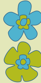
funky flowers 55042