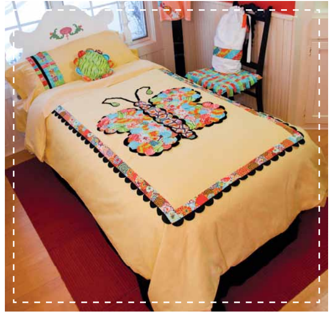
For the project in this photo, two full/flat sheets were sewn together to make a twin-size duvet cover.